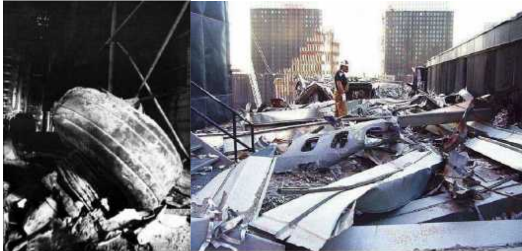
"Piece of Flight 11 gear"

The only official document containing photographs of debris attributed to the aircraft that allegedly crashed into the Twin Towers of the WTC is FEMA's WTC Building Performance Study (BPAT).