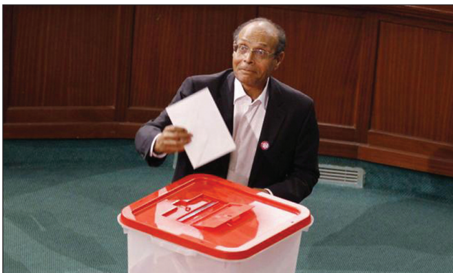
US NED-funded activist leader Moncef Marzouki, after spending two decades in exile in Paris, helps foist the facade of “democracy” onto the Tunisian people.

the Executive Board] of the Arab Commission for Human Rights, a collaborating institution with the US NED World Movement for Democracy.