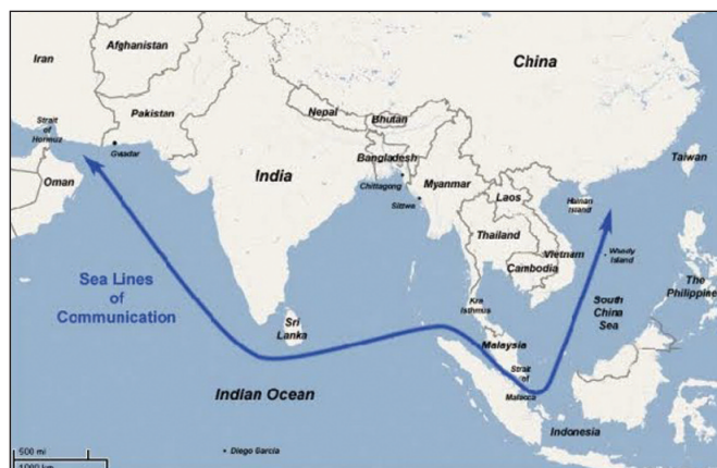
The “String of Pearls”: China’s oil lifeline is to be cut by the destabilisation and regime changes being made throughout Africa and the Middle East. Along the “String”, the US has been destabilising nations from Pakistan to Myanmar, from Malaysia to Thailand, to disrupt and contain China’s emergence as a regional power.

Hillary Clinton, for the November 2011 edition of Foreign Policy Magazine , penned “America’s Pacific Century”, a declaration of imperial intent for American “leadership” in Asia for the next 100 years. The article