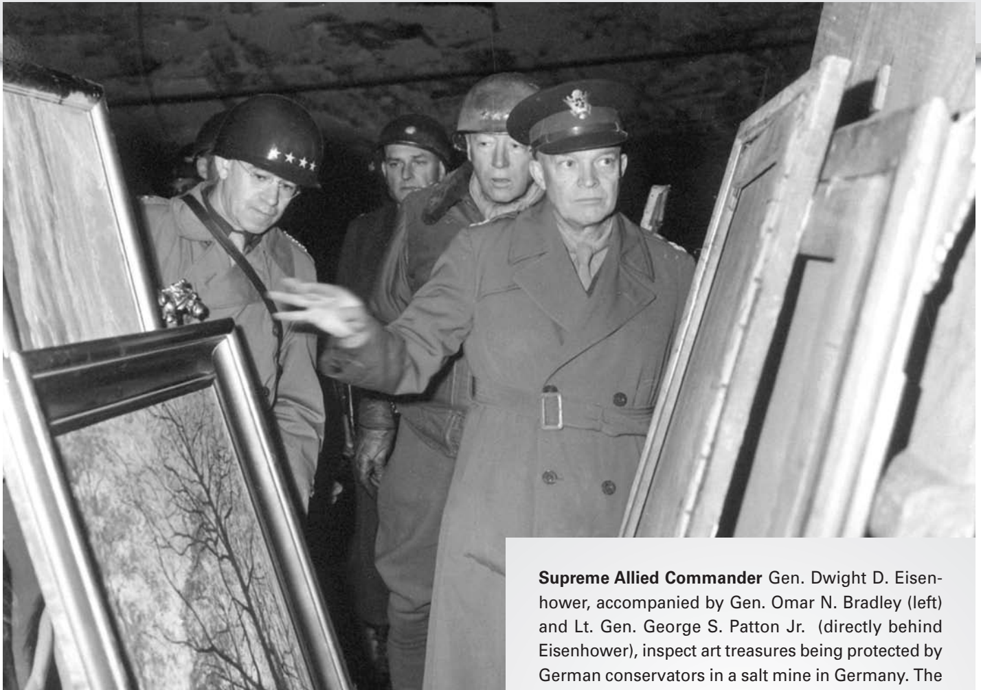
Supreme Allied Commander Gen. Dwight D. Eisenhower, accompanied by Gen. Omar N. Bradley (left) and Lt. Gen. George S. Patton Jr. (directly behind Eisenhower), inspect art treasures being protected by German conservators in a salt mine in Germany. The salt mine in Merkers was found to contain Reichsbank wealth and museum paintings that had been removed from Berlin for safekeeping. As TBR readers know, Gen. Eisenhower was personally responsible for the purposeful mass murder of over 1 million surrendered German soldiers—kept in open-air pens in freezing weather without proper sanitation or necessary food rations—after the war.