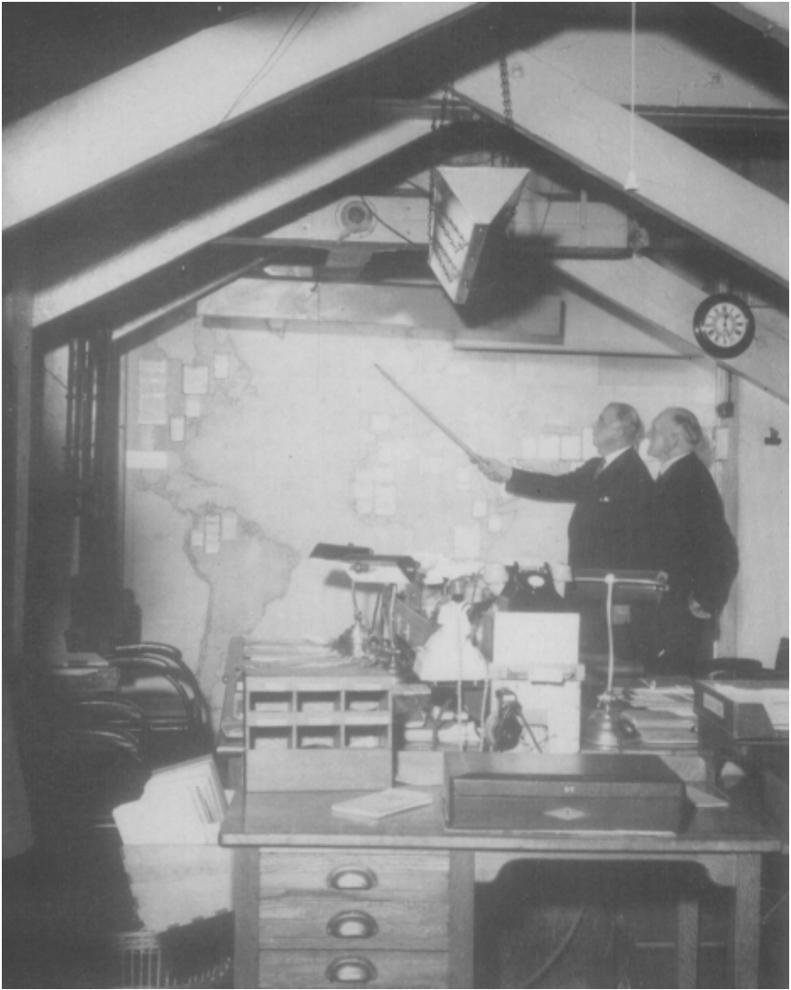
The secret underground headquarters of the war cabinet and the chiefs of staff in Marsham-street, Westminster, London. The building, designed to hold over 2,000 people, included radio and power stations. Shown here is Lord Ismay in the map room of the underground headquarters. With him is Mr G. Ranse, to whom all correspondence was addressed during the war, when the war cabinet offices were a top-priority secret.