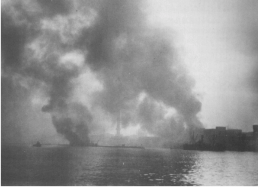
London docks ablaze after a German mass fire-bomb raid in September 1940. This photograph was censored at the time and not released for publication for many years. It was marked, 'Not passed by censor.'