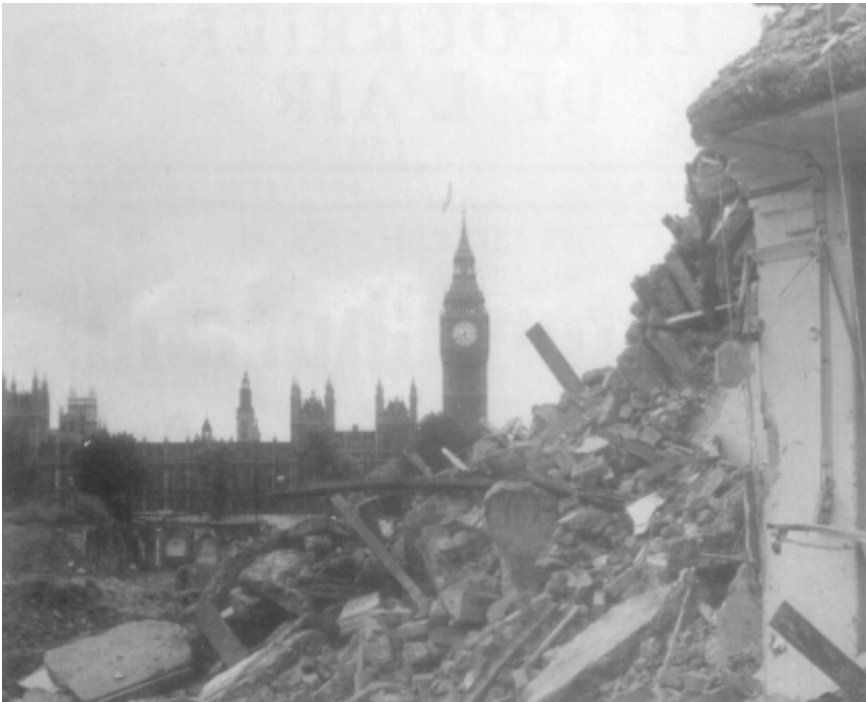
Churchill's vision of London in ruins came true — and there were those who said he would not have wanted it otherwise.