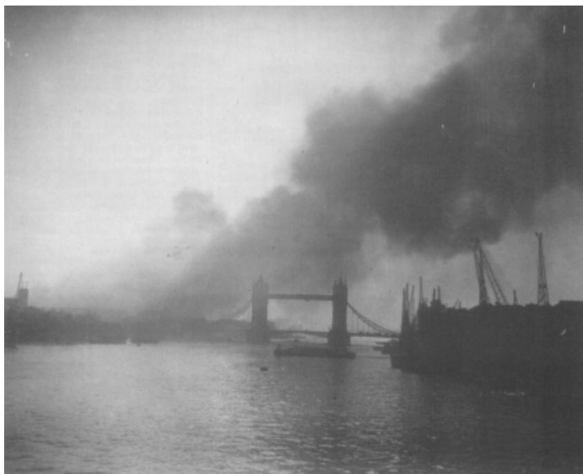
For a whole year – as Churchill was aware from intercepted Nazi signals – Hitler forbade his airforce to bomb London. In August 1940 Churchill bombed Berlin. In September the Germans hit back.

It was the language that mattered, and that was as difficult to capture as the splash of a sunset on a mountain range. Churchill treated Hopkins that Saturday to his customary recital of events. The American flattered him that the president brought a radio into cabinet to listen to the historic speeches, but to Winston 1940 was a blur. The only speech he recollected was one to junior ministers after Dunkirk: he had realised even as he spoke