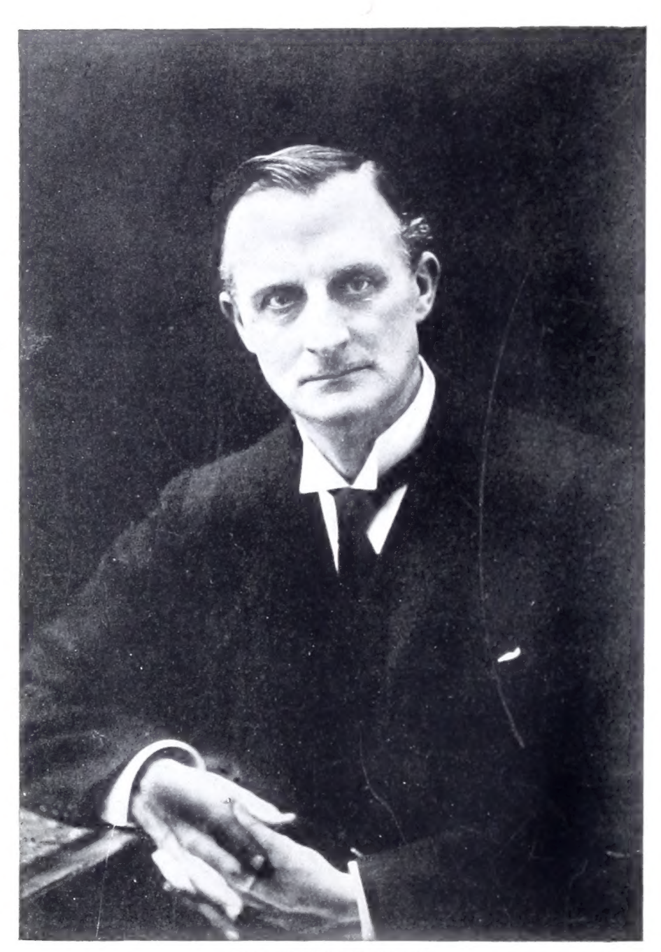
SIR EDWARD GREY