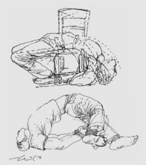
Figure 4. The "banana" tie. Illustration by David Gerstein from B'Tselem, Interrogation of Palestinians during the Intifada .

The interrogators beat the suspects on the face, the chest, the testicles, the stomach, in fact on all parts of the body. In the course of the beatings, the detainees' heads are sometimes smashed against the wall or the floor and they are kicked in their legs.