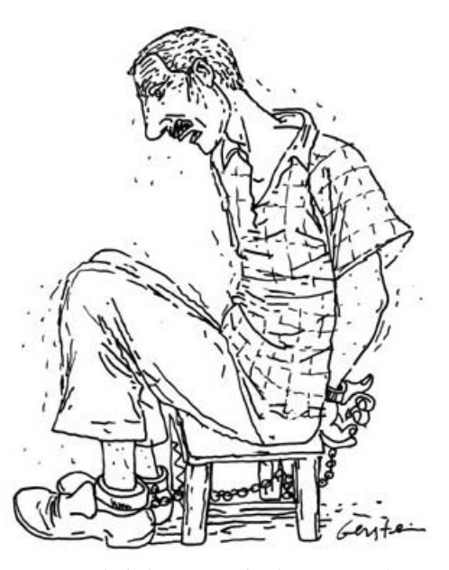
Figure 6. "Shabeh," a standard torture technique. Public Committee Against Torture in Israel, Back to a Routine of Torture , p. 55.