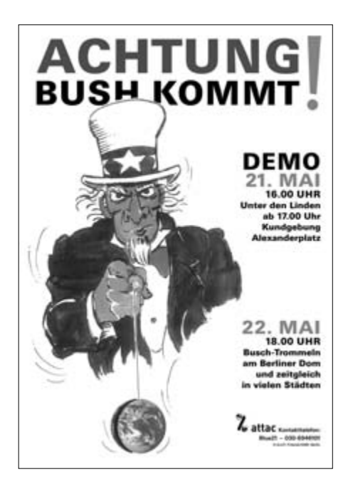
Figure 1. The case of the elusive Semitic proboscis. Design by Uta Eickworth, Berlin.

and "independence, sovereignty" in Israel is also anti-Semitic-but doesn't this mean that, regardless of where Jews happen to reside, Israel is their state? And who can dispute that he acts like a loyalist of Israelor, at any rate, its paid agent? It was "anti-Semitism pure and simple" when "Belgium, the seat of the International Court of Justice at [T]he Hague, ... sought to indict the prime minister of the state of Israel for crimes against humanity," and also when Danes opposed the appointment by Israel of a notorious torturer as ambassador to Denmark. Foxman justifies this charge of anti-Semitism on the grounds that comparable criminals have escaped accountability. Leaving aside that The Hague is not in Belgium but the Netherlands, don't all criminals (and their apologists) cry selective prosecution? But only the likes of Foxman would claim that holding murderers and torturers accountable for their crimes is anti-Semitic as well. To allege that the American Israel Public Affairs Committee (AIPAC) targets candidates critical of Israel, Foxman asserts, "echo[es] familiar anti-Semitic slanders"-even though AIPAC boasts about doing this. Nonetheless, Foxman assures readers regarding the epithet anti-Semitic that "we're very careful about how and when we use it," and ADL has "given a great deal of thought to