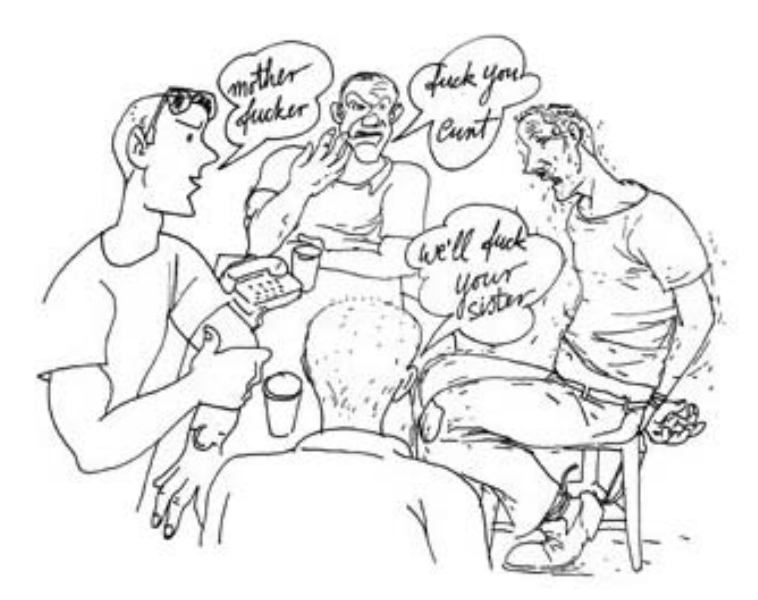
Figure 5. Humiliation during interrogation. Public Committee Against Torture in Israel, Back to a Routine of Torture: Torture and Ill-treatment of Palestinian Detainees during Arrest, Detention and Interrogation, September 2001–April 2003 (Jerusalem, April 2003), p. 51.