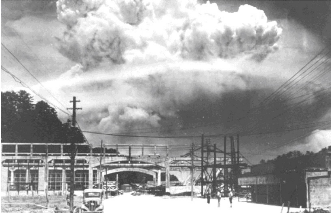
(above) Hiroshima (below) War's End 198