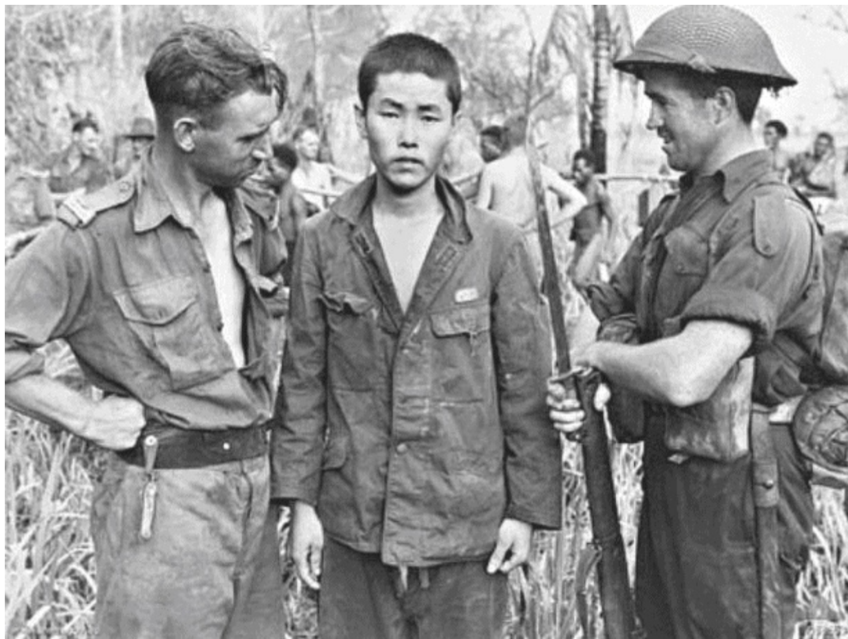
(above) One of the Few—A Live Captive (below) Leni Riefenstahl