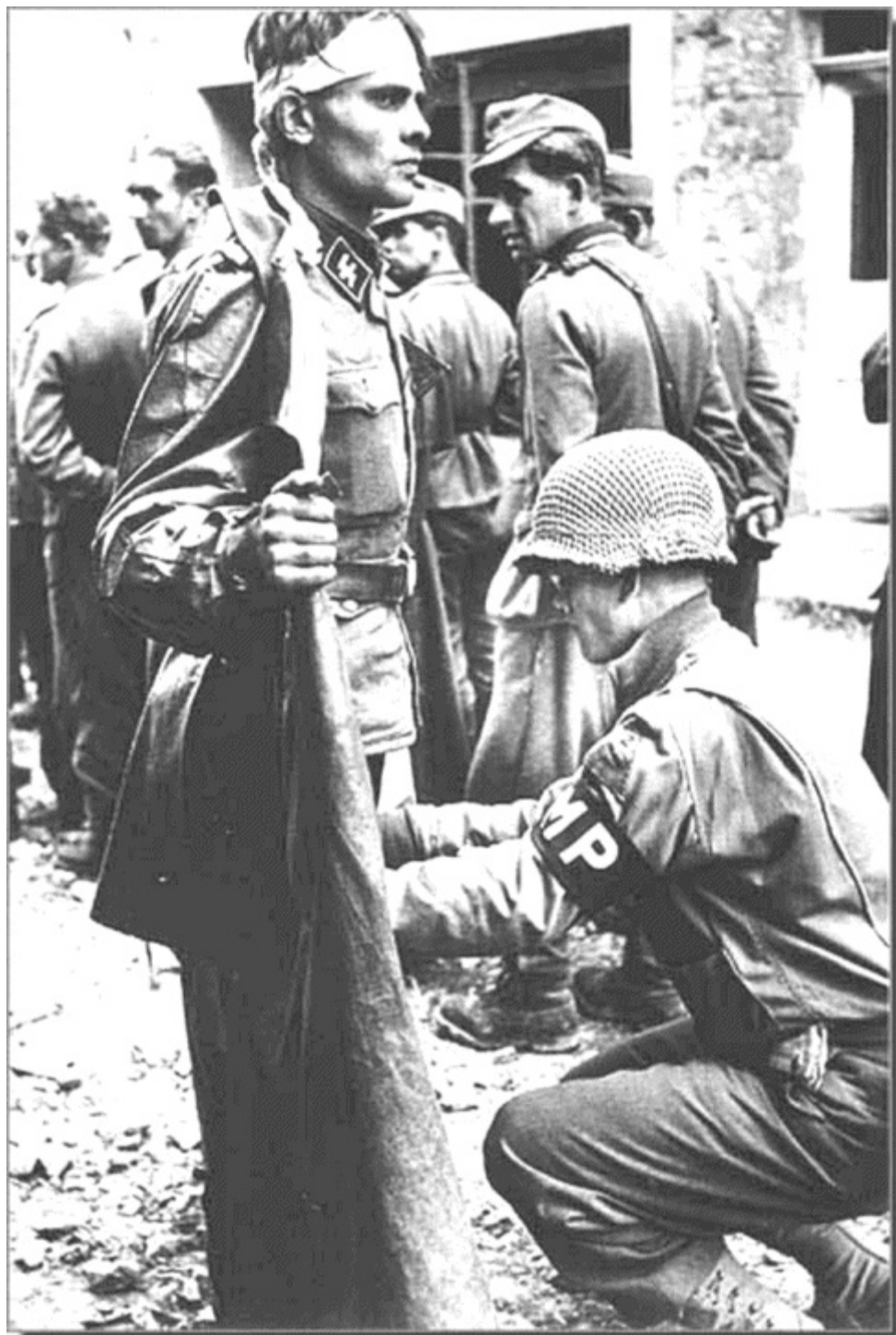
(above) Surrender (below) Edvard Beneš