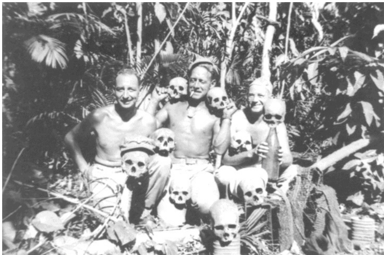
(above) Somewhere in the Pacific (below) US Death Camp