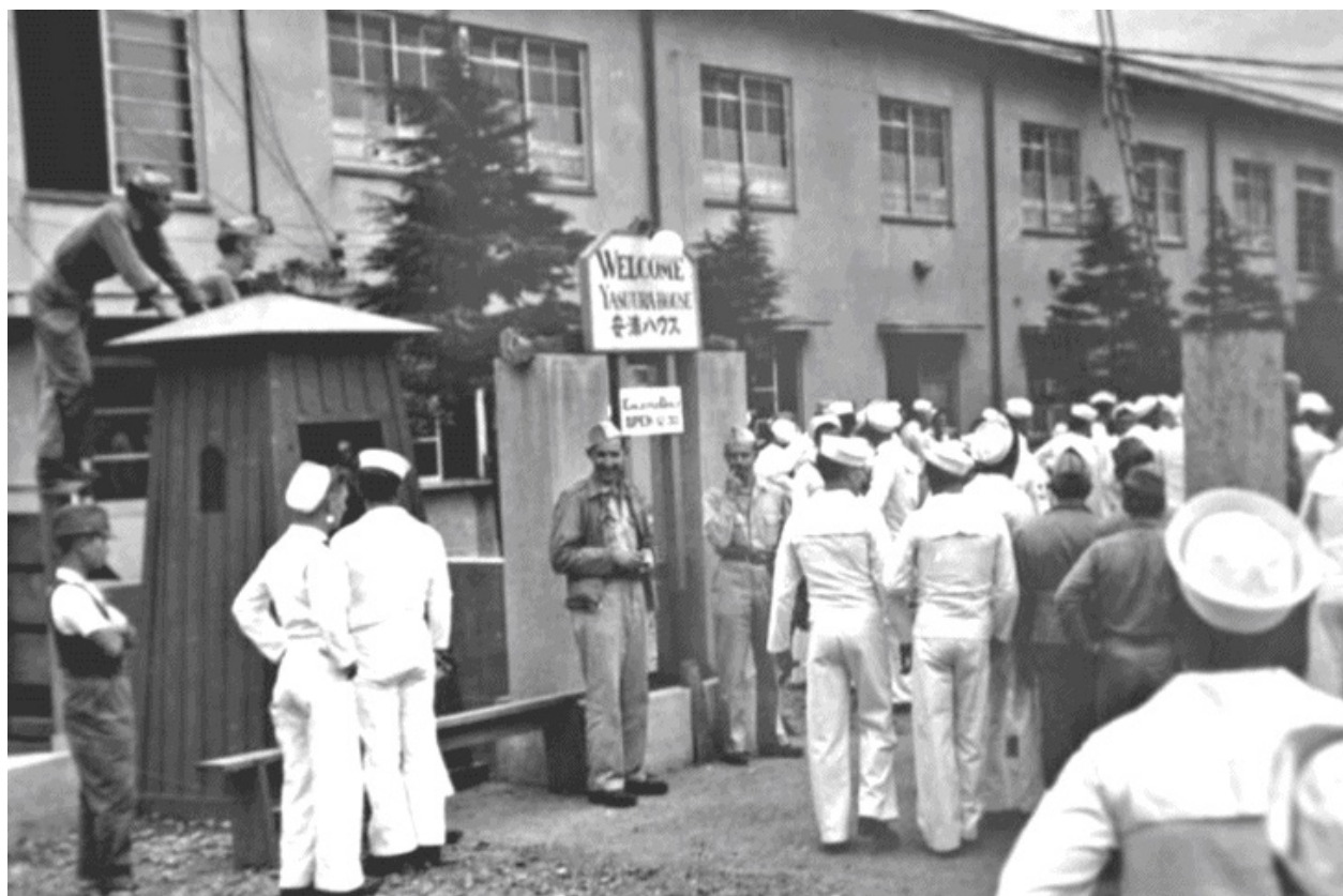
(above) Japan—Comfort Station (below) Victors and Victims